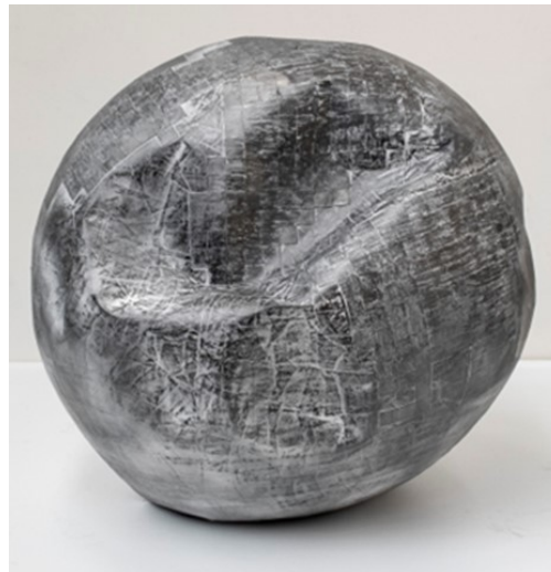
Image top left: Al Munro, Regular/irregular (round 1) , 2022, acrylic paint on boxboard and birch panel, 50 cm diameter