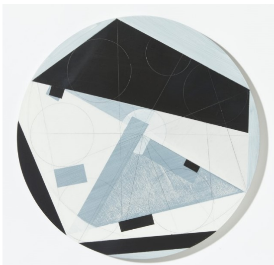
Image: Lynne Eastaway, Disc I , 2023, acrylic on wood panel, 40 cm diameter (one of five pieces)