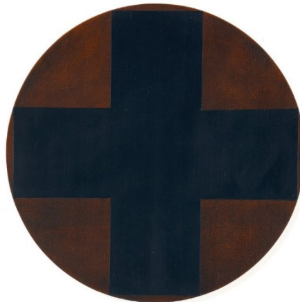
Image top left: Dani Marti, Pointless - Blanc Cendrós , 2022, customised reflectors, glass beads on aluminium frame, 128 cm diameter x 28 cm depth,